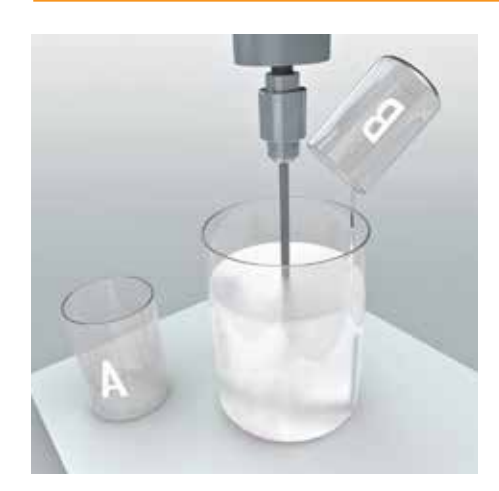
ELASTOSIL® FX A/B: Weigh and mix the two components