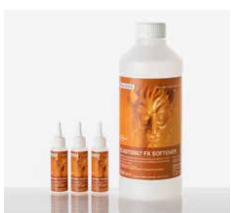
ELASTOSIL® FX product range