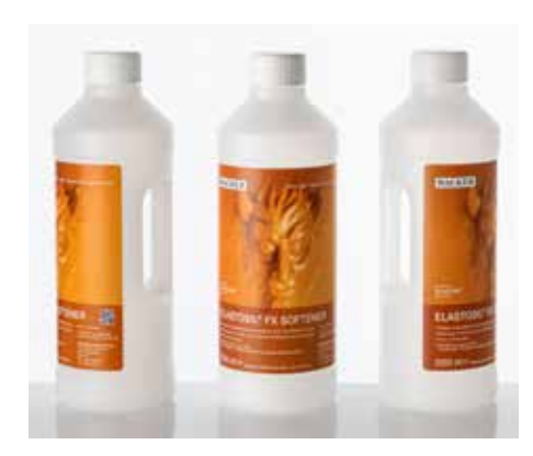
ELASTOSIL® FX Softener in 2 kg bottle with convenient handle

Here are 2 sample calculations starting from ELASTOSIL® FX 20 and from FX 10. The amount of Softener to add is calculated as a percentage of the total of components A and B. Example: 50% addition = 50g A + 50g B + 50g Softener