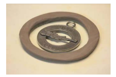
Fig. 2: Make a border of plasticine around the model as a barrier for the silicone.