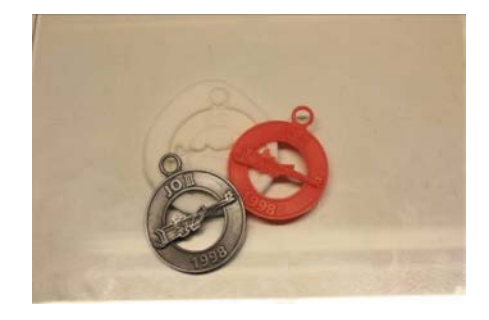
Fig. 5: The mother model, mould and a copy out of red casting wax.